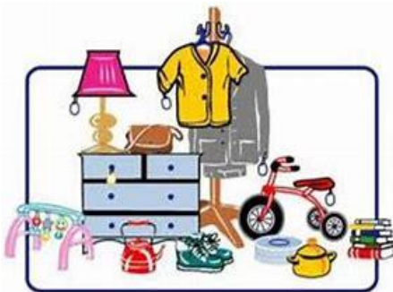
TABLE TOP SALE